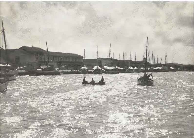
The schooner harbour at Oranjestad.

VOL. 1, No. 6, NOVEMBER 1966 Printers: Verenigde Antilliaanse Drukkerijen